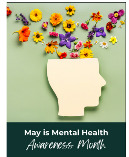
May is Mental Health Awareness Month